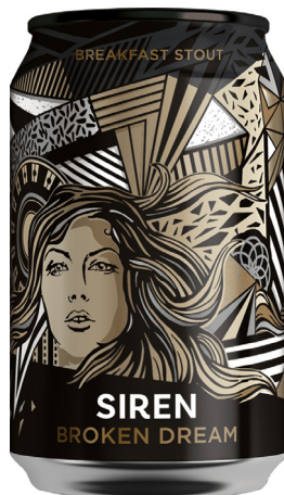
The award winning 'Broken Dream'

It comes down to having options! Also, we had a lot of beer that was kegged pre-lockdown sitting in the cold store. It's still in great condition, having been kept at a constant 4 degrees, but it can't sit there forever. The Mini