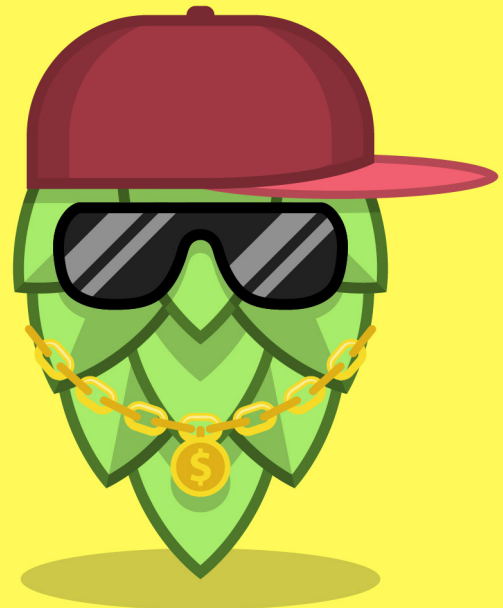
Illustration by Matt Rogers