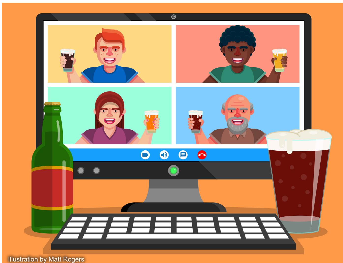
Illustration by Matt Rogers