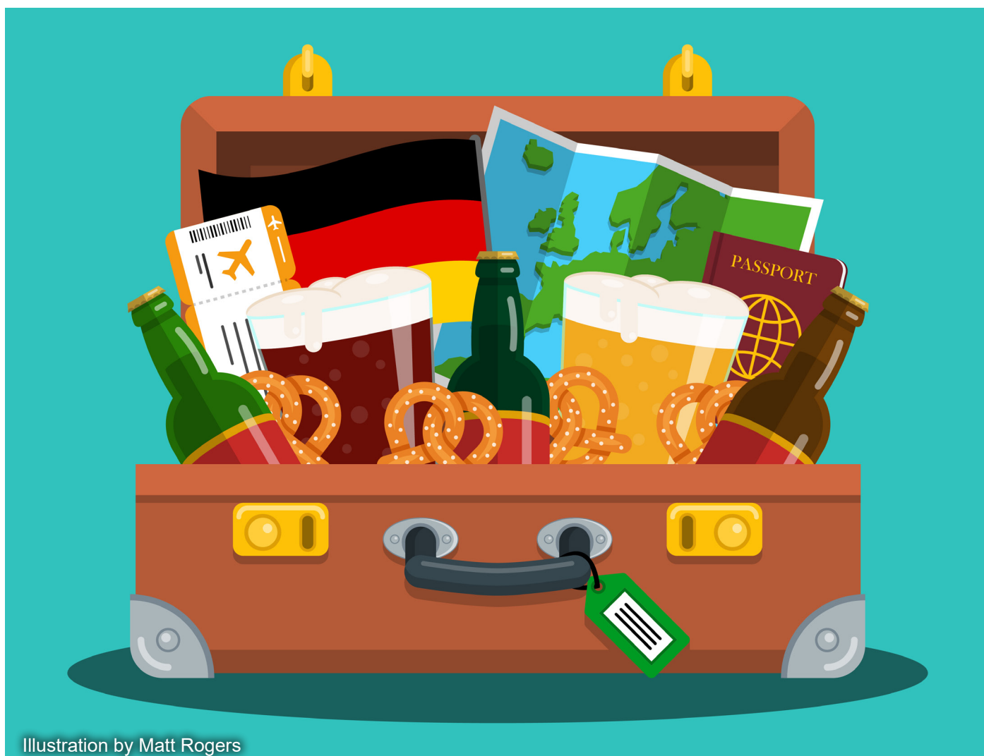
Illustration by Matt Rogers