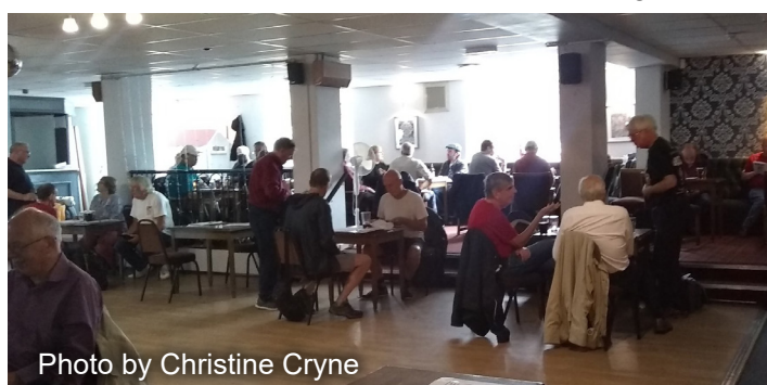
Marlow Royal British Legion Beer Festival

to provide track and trace details, and have our temperature taken. Having passed the first exam, we could form a socially distanced queue for the bar. Once we had our beers we could sit inside or outside. All the tables inside had been set up for two or four people, 2 metres apart. You were asked not to move the furniture!" Alan praised the range of dark beers available, including Ashover