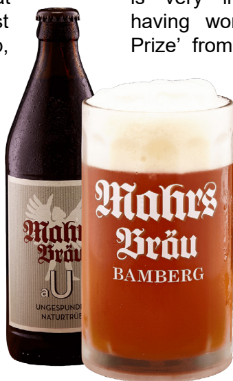
Mahrs Bräu 'AU'